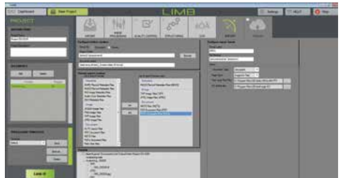
Multiple export settings